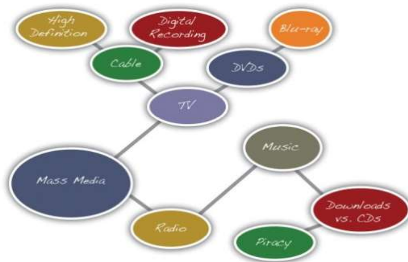
Tuyet's Idea Map

Notice Tuyet's largest circle contains her general topic, mass media. Then, the general topic branches into two subtopics written in two smaller circles: television and radio. The subtopic television branches into even more specific topics: cable and DVDs. From there, Tuyet drew more circles and wrote more specific ideas: high definition and digital recording from cable and Blu-ray from DVDs. The radio topic led Tuyet to draw connections between music, downloads versus CDs, and, finally, piracy.